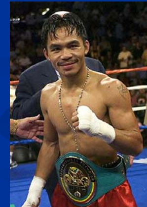
MANNY "PACMAN" PACQUIAO Reigning WBC International Super Featherweight Champion