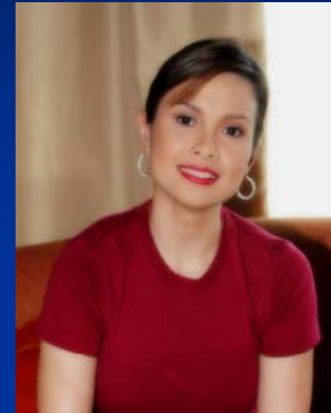
MS. LEA SALONGA World Renowned Theater Actress & Singer