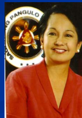
GLORIA MACAPAGAL-ARROYO President, Republic of the Philippines