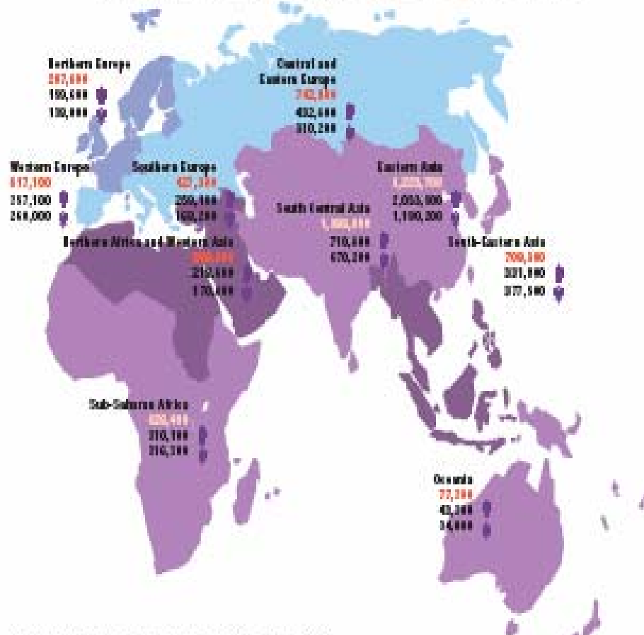
Percentage increase in cancer deaths since 2002