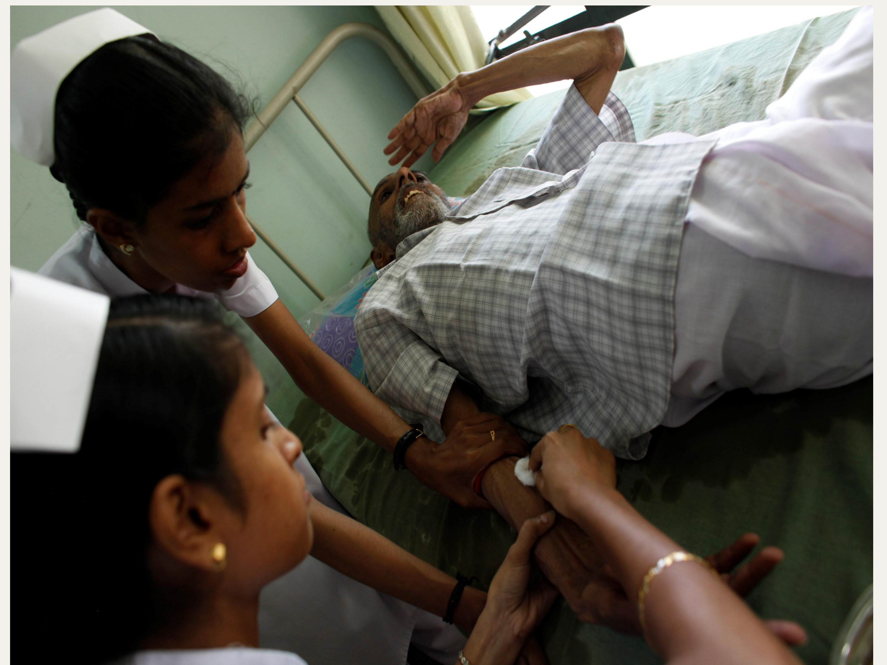
A nurse prepares to administer an IV for a 72-year-old palliative care patient in Kerala.

Given the considerable symptom burden and inadequacy of their treatment, palliative care should be integrated into India's HIV response. The National AIDS Control Organization should provide healthcare workers with basic training on palliative care. All healthcare centers that provide services to people living with HIV should ensure the availability of essential palliative care medications, including oral morphine.